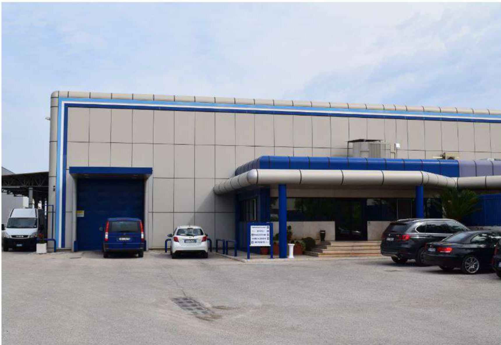
ALBA&N in TRANI 6,000 square meters of surface