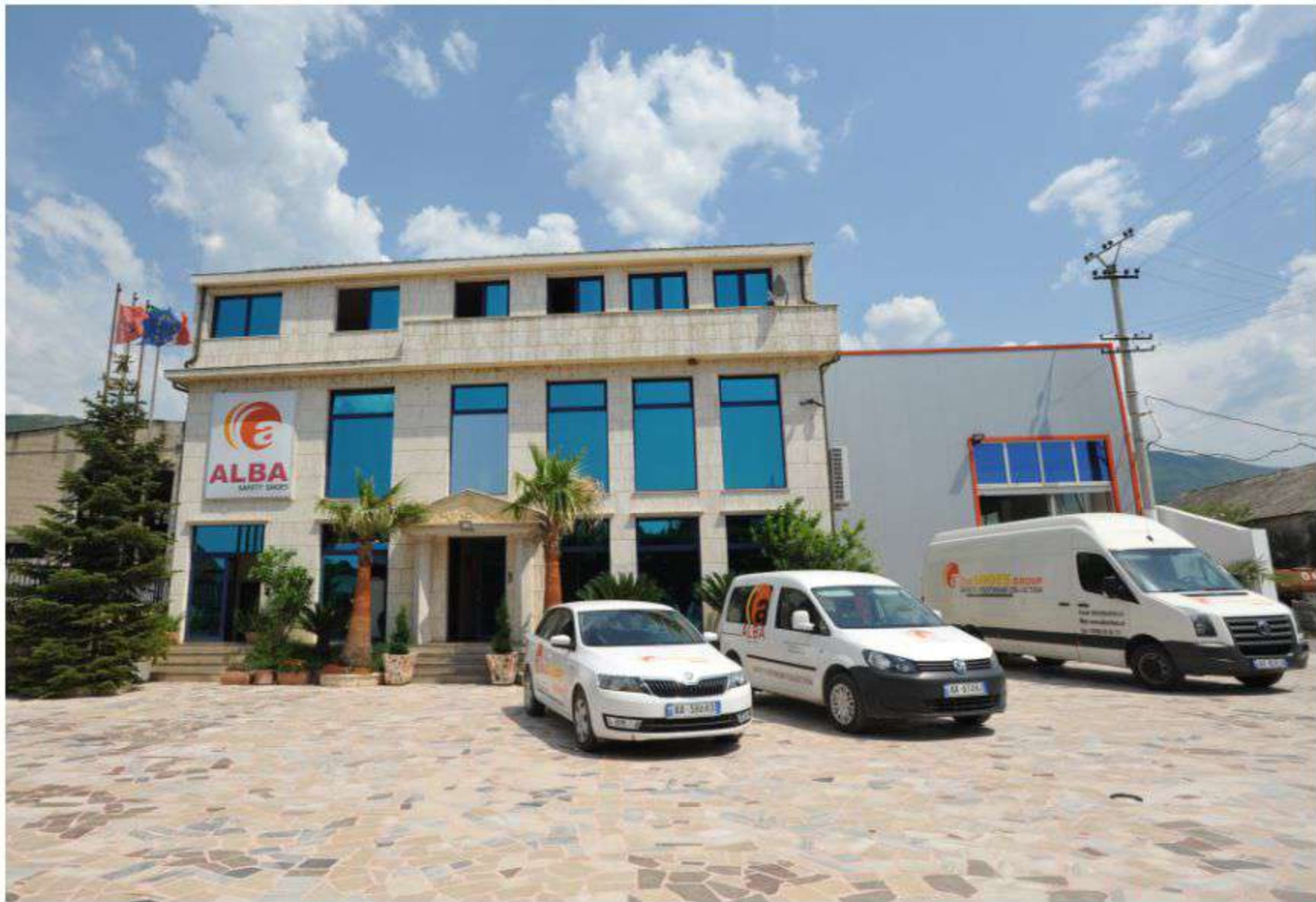
Alba Shoes in LAC 30,000 m2 of surface area