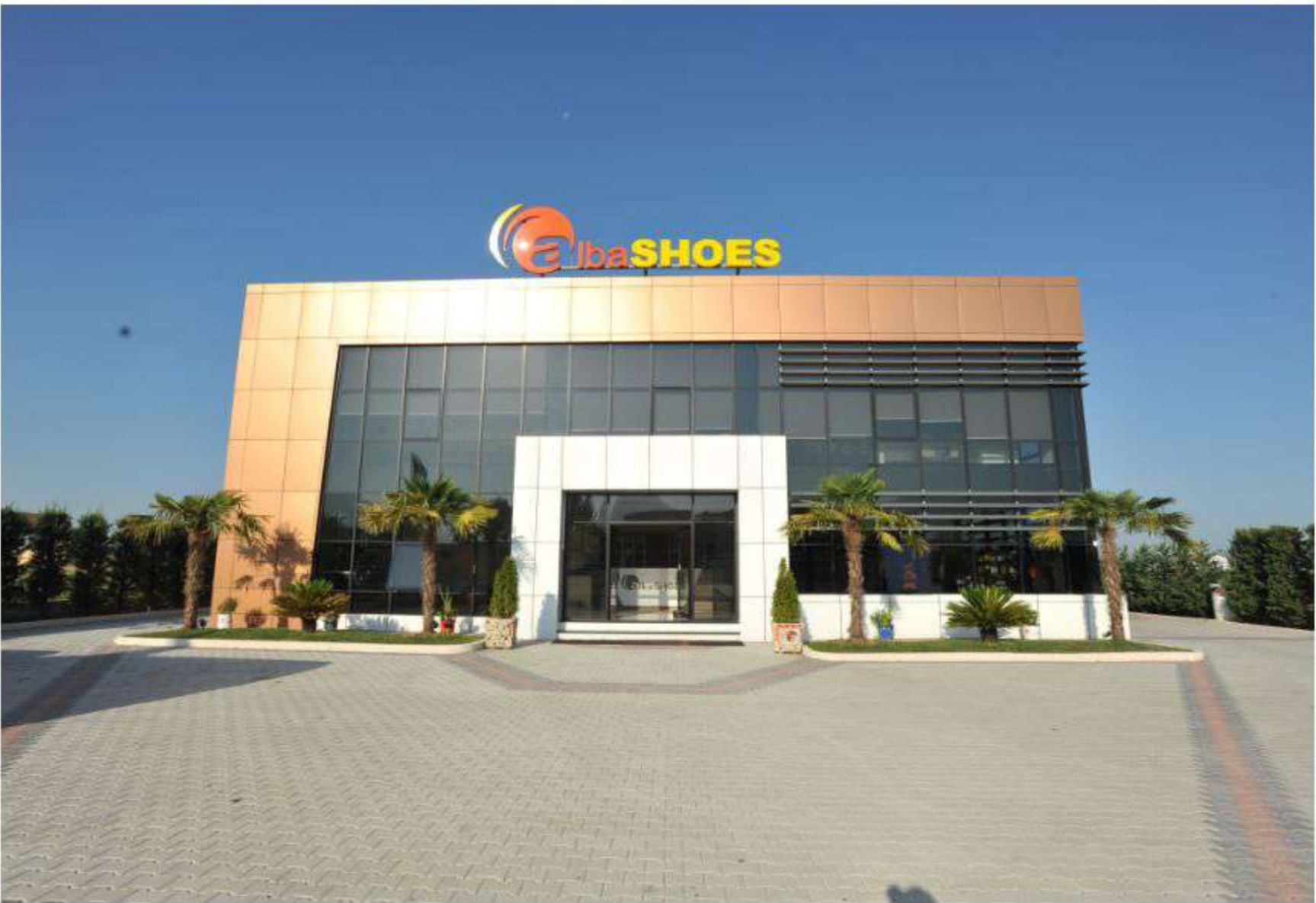
Alba Shoes in TIRANA 5,000 m2 of surface area