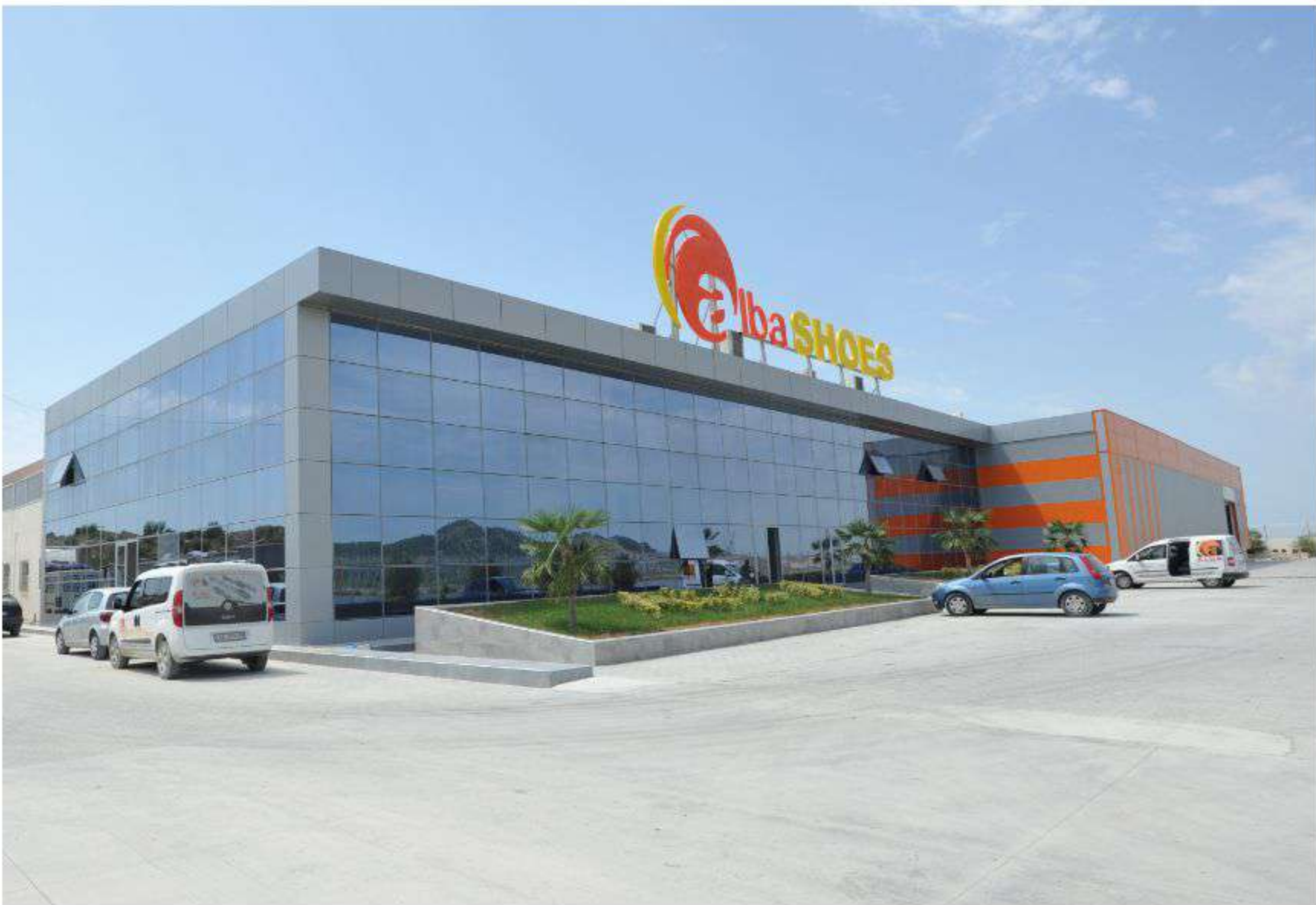
Alba Shoes in VALONA 16,000 m2 of surface area