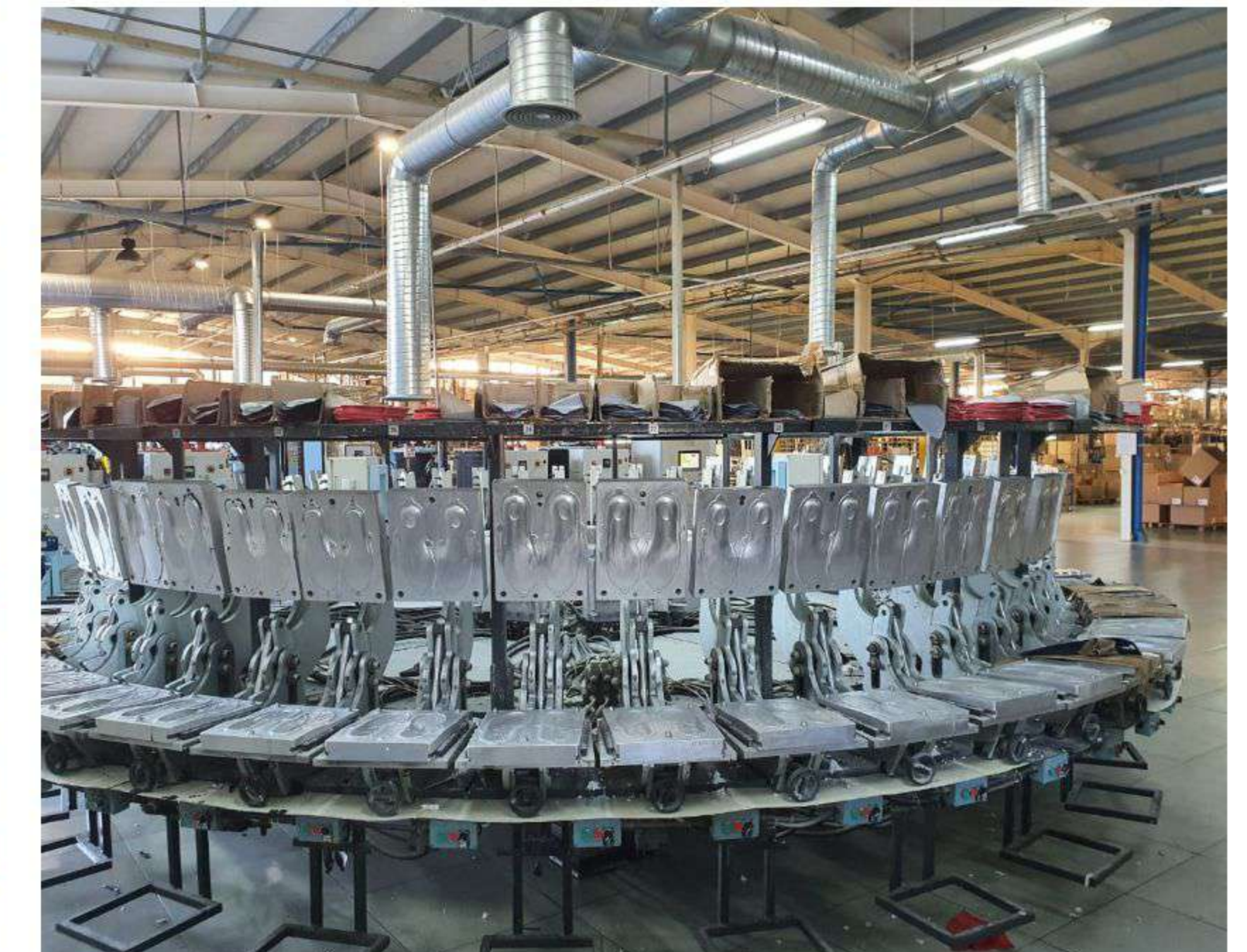
Carousel Injection Insoles