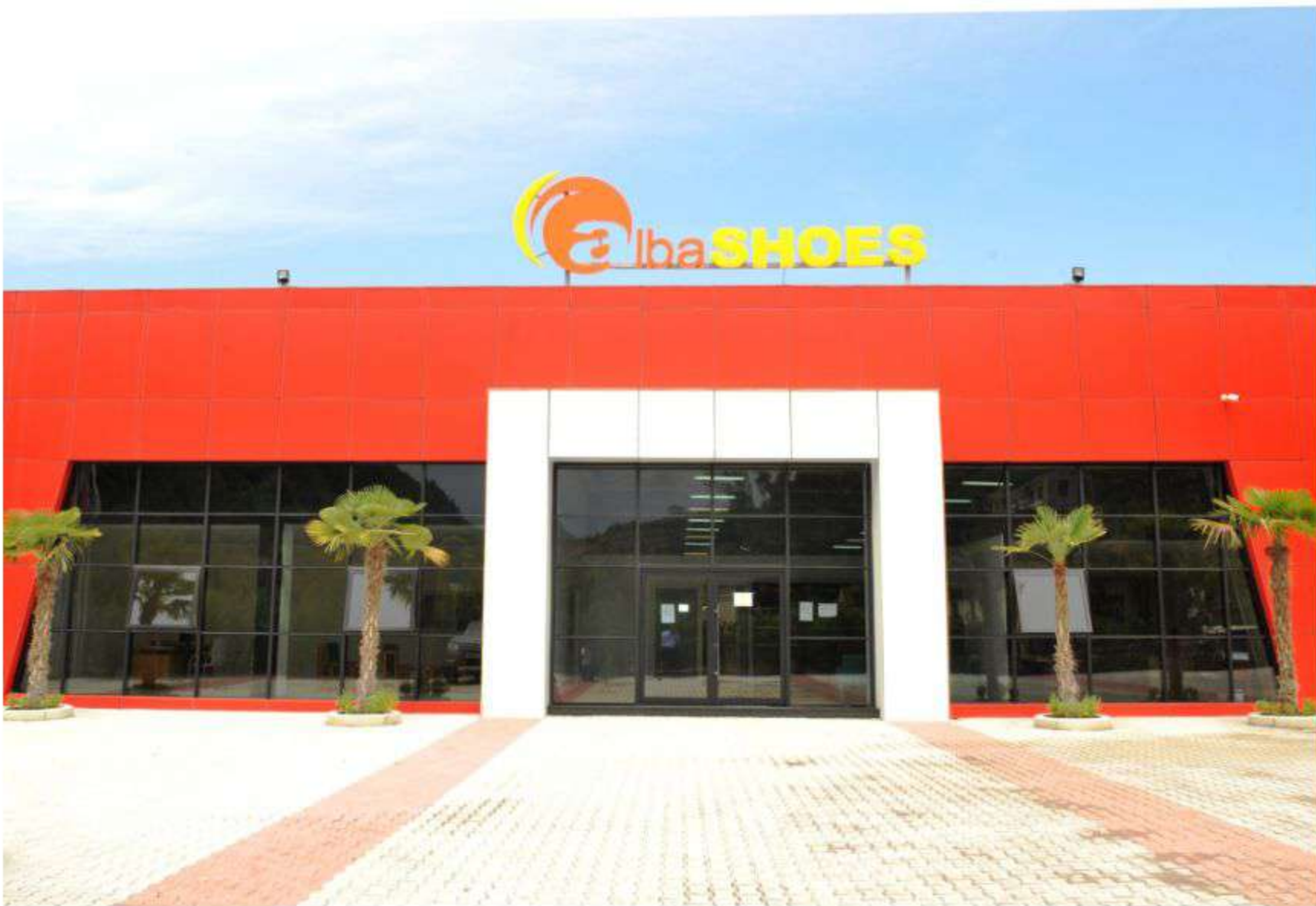
Alba Shoes in CEROVODE 3,000 m2 of surface area